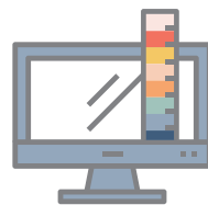
SafeDose® Digital Tape